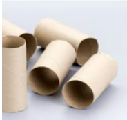
Help us take this,